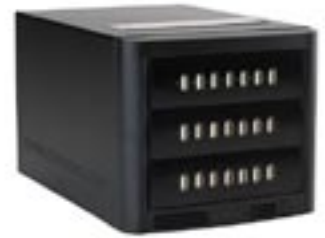
(USB Duplicator from Aleratec)